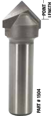
PART # 1504