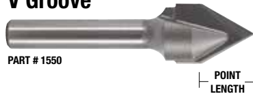
PART # 1550