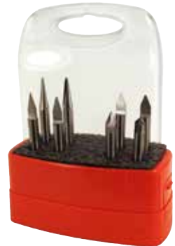
ENGRAVING SET #708

#708 Engraving Set contains eight 1/4" Engraving bits with an included angle ranging from 15° to 90°. All types of projects will appear visually stunning with the many engraving options that exist from this one kit.